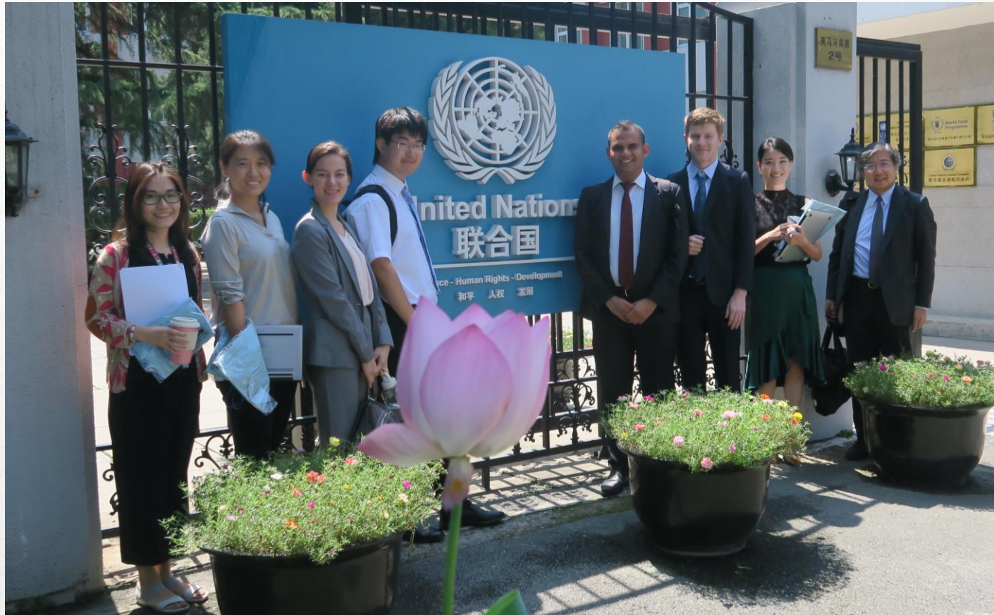
United Nations Development Programme (UNDP) China Office in Beijing, China August 2018