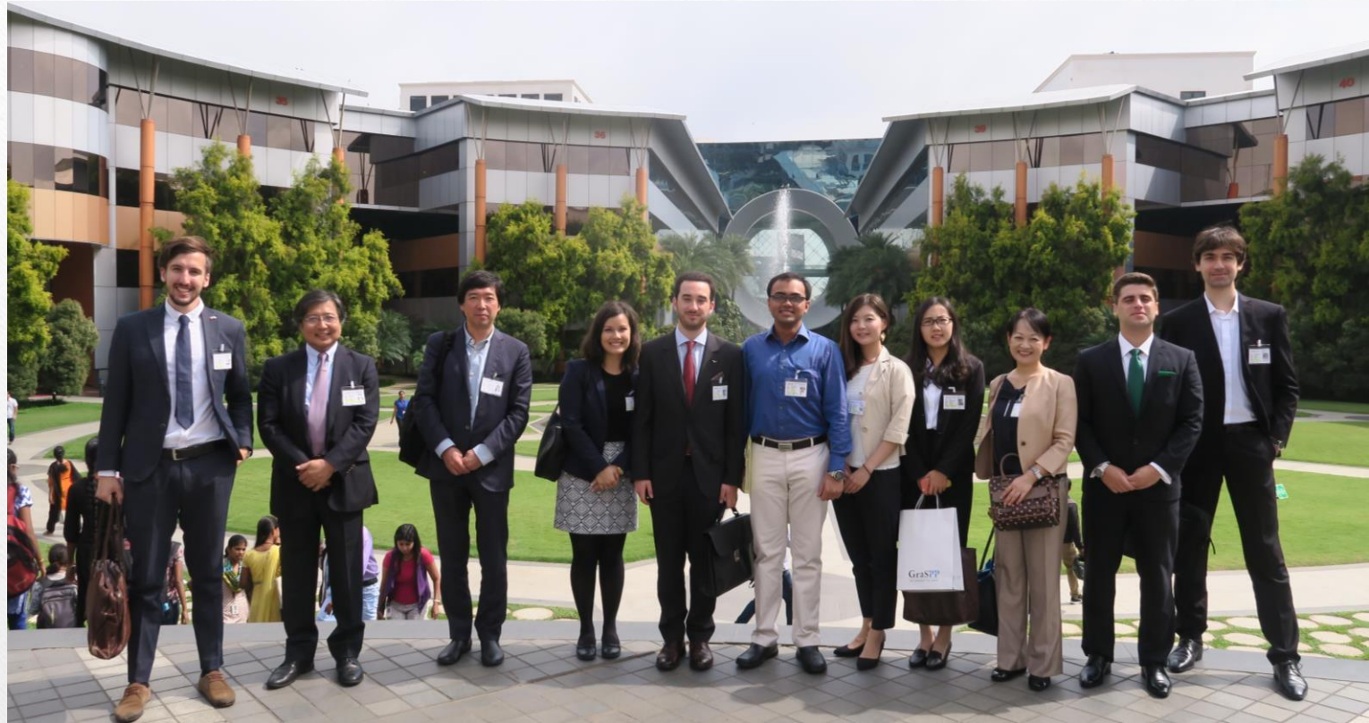
Infosys campus (corporate HQ) in Bangalore, India August 2016