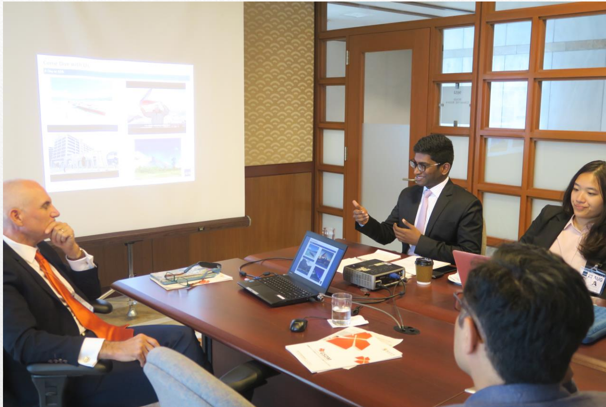
Asian Development Bank in Manila, Philippines August 2017